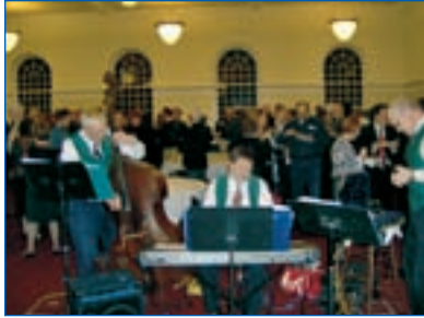
Music to Dine: Music to accompany the dining. One of three groups providing music during the event